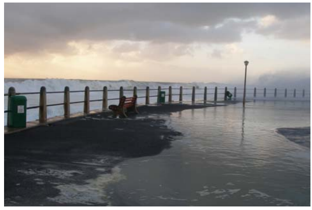
Seapoint in Cape Town was flooded in one of the most vicious storms the city has seen in months.

* see occasional research paper series, on our website <a href="https://www.firechildren.org">www.firechildren.org</a>