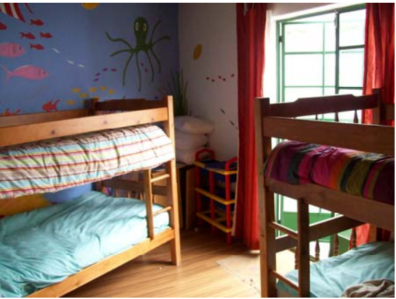
The "after"-bedroom—a colourful, comfortable and safe haven for burned and blind children.