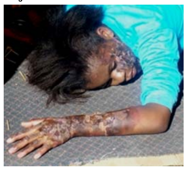
A volunteer actress with fake burn injuries during the filming for the 'Exploding Paraffin Stove'

So Children of Fire approached The Jupiter Drawing Room, an advertising agency that makes ads for the likes of Sasol and Nike. A fiery presentation to the executive board got them to agree to make three of the ten infomercials by the end of February 2009. We hope for a long-term relationship with The Jupiter Drawing Room, to help make the remaining seven infomercials for us.