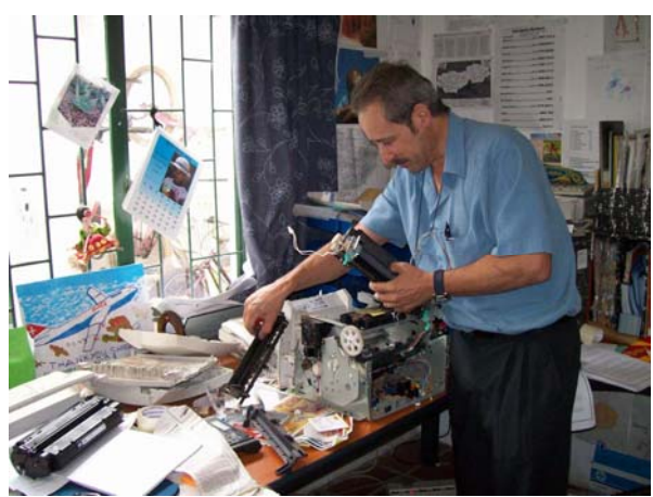
A working printer is more essential to Children of Fire's work than sweets and teddy bears.

So if you want to help by making a donation: we take second-hand clothing, toys, stationery, furniture—anything that is not completely broken or useless. And if you really want to help but are not sure how, ask. You can make a difference. Quite honestly though, money is the most useful.