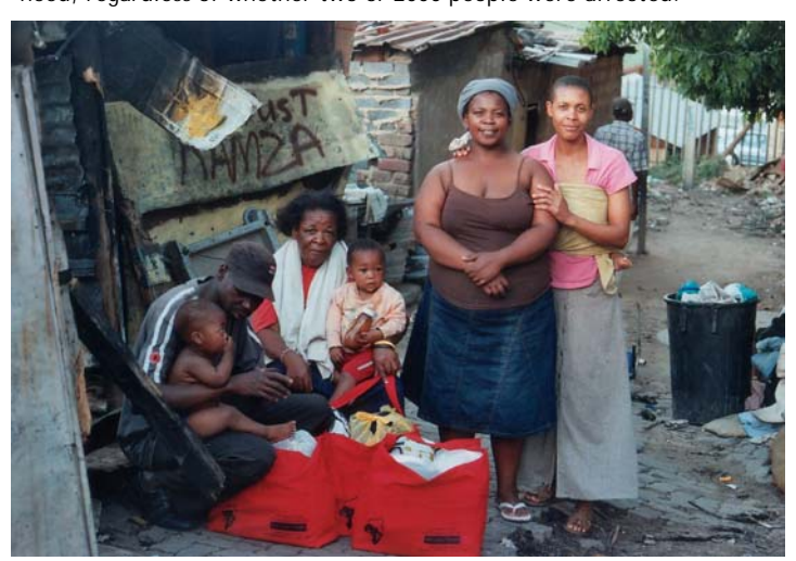
Happy recipients of red Disaster Recovery Bags, 18th Avenue, Alexandra

Small fires like this one are often overlooked by emergency services and not regarded "disastrous" enough for disaster management to step in. Nonetheless, people have lost their homes and belongings and need help to get back on their feet. It is then that the importance of UMashesha volunteers shows, for they help speedily wherever there is a need, regardless of whether two or 2000 people were affected.