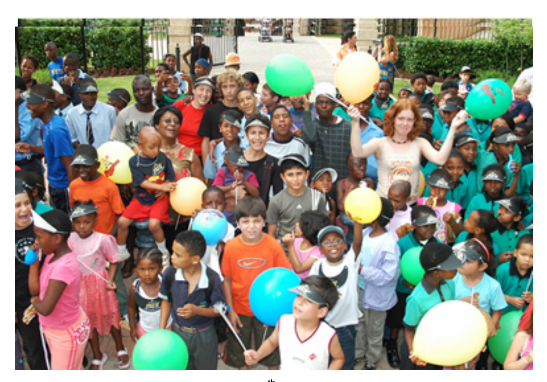
January 13<sup>th</sup> 2006 outing