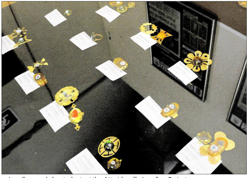
Jewellery made by students at the Atteridgeville Jewellery Project.